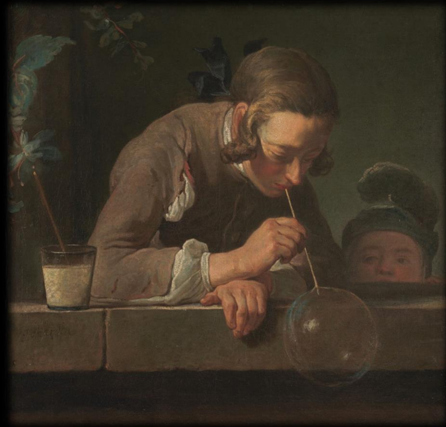
Jean Siméon Chardin 1733