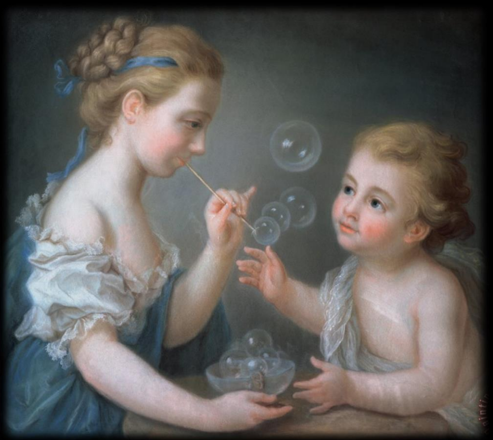
Jean-Étienne Liotard mid 1700's