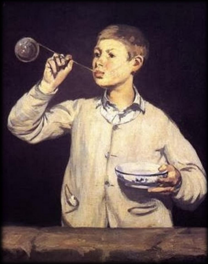
Édouard Manet 1867