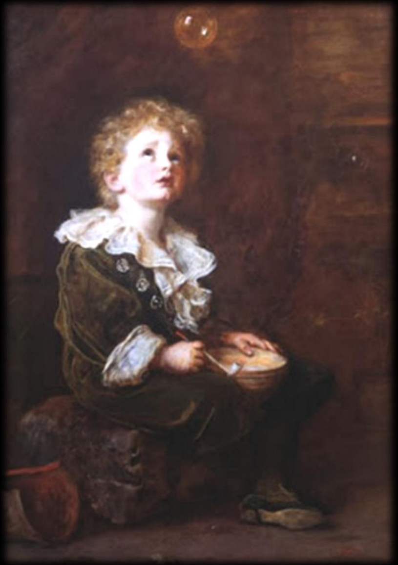
John Everett Millais 1886